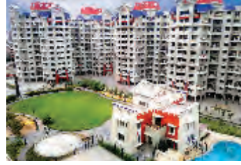
Dreams Aakruti, Hadapsar