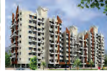
Dreams Veeroday, Kharadi