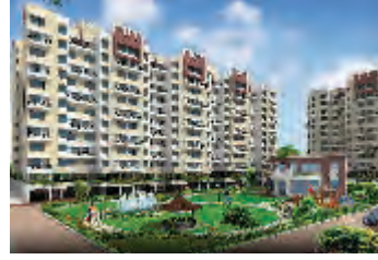
Dreams Elina, Hadapsar