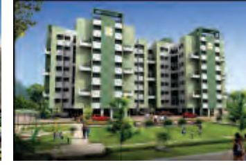
Dreams Sankalp, Wagholi