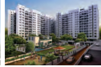
Dreams Onella, Hadapsar