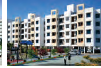
Dreams Ayana, Sate (Kanhe Phata, Maval)