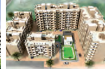
Dreams Rakshak, Wagholi