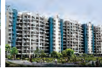
Dreams Wisteria, Pisoli