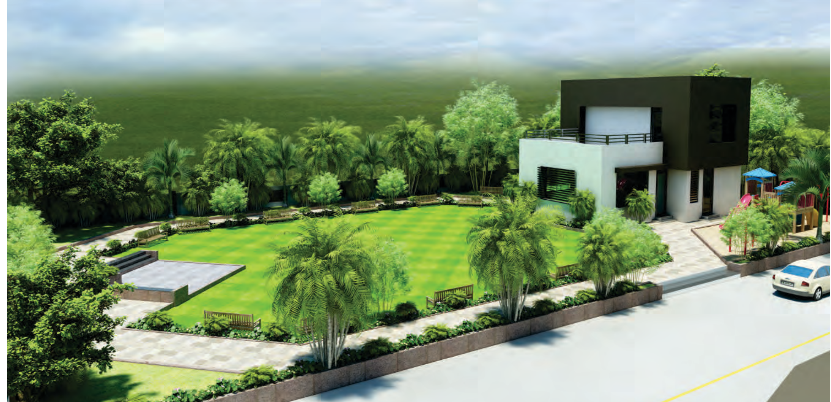
Site layout at dreams ragini

LEGENDS: 1 Entrance 2 Amenity Space 3 Jogging Track 4 Lawn 5 Club House 6 Children's Play Area 7 Parking