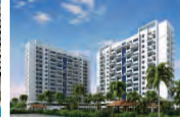
Dreams Aryan, Hadapsar