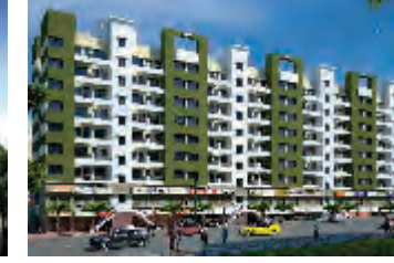
Dreams Rachana, Hadapsar