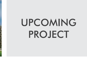
Dreams Solace Phase- I & II, Hadapsar