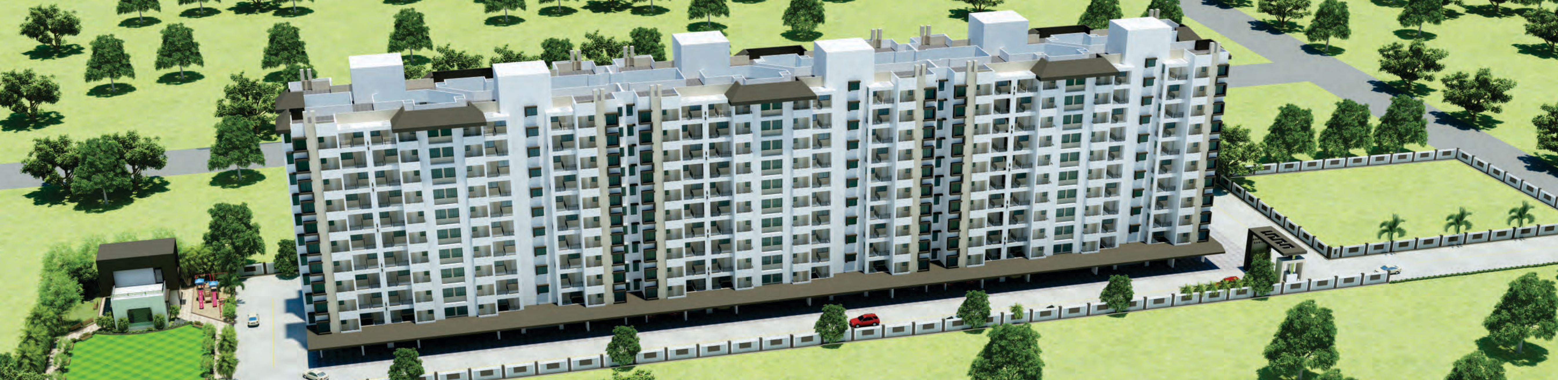
Bird's eye view of Ragini