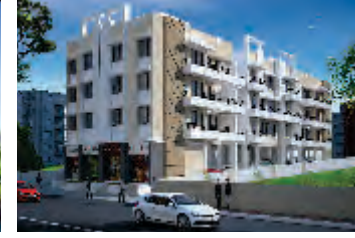
Dreams Camellia - Bavdhan