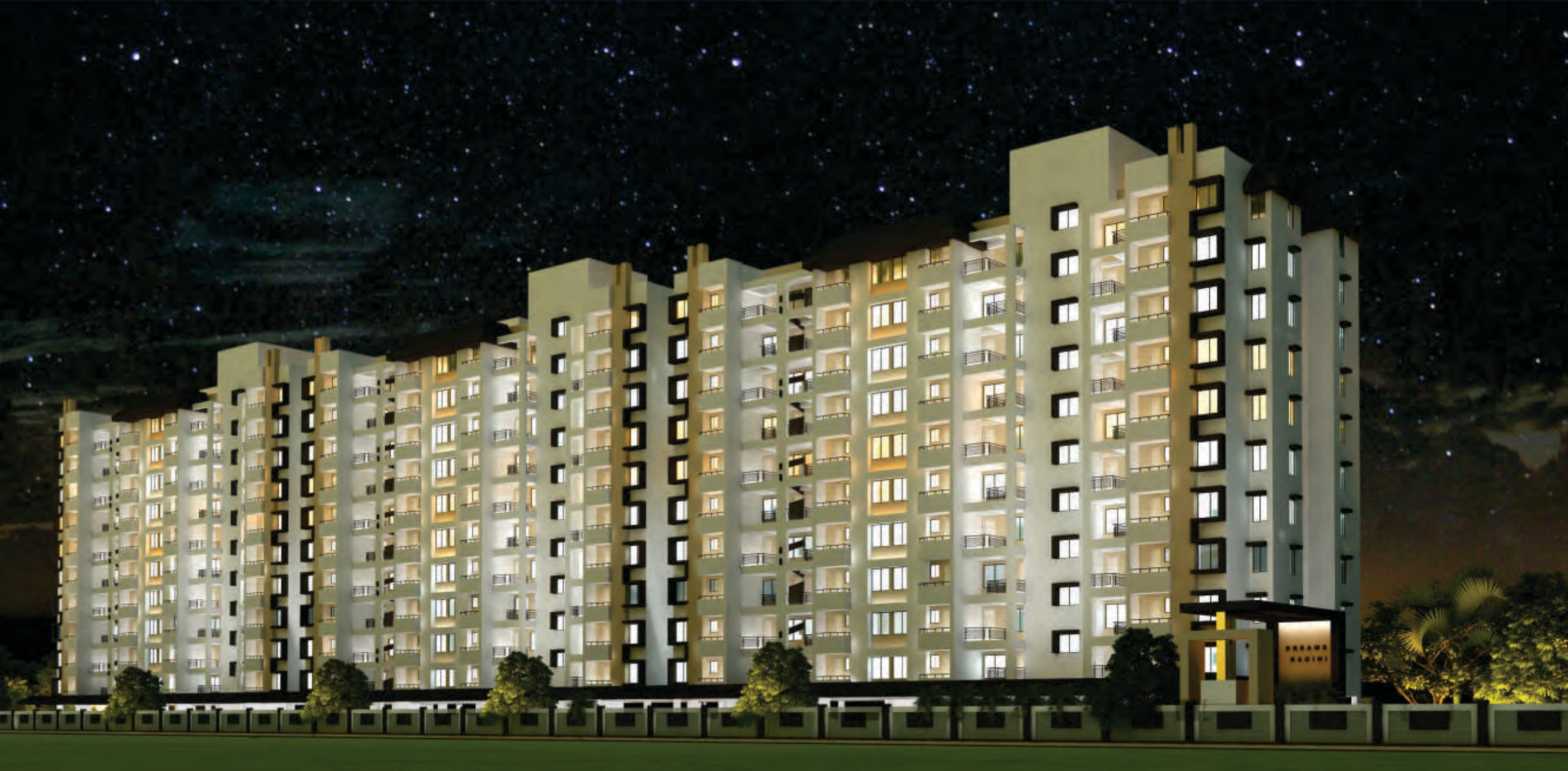
Night view of Ragini