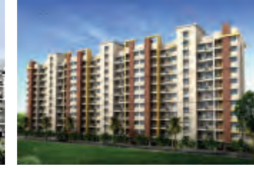
Dreams Avani, Manjri