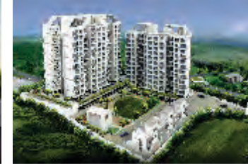
Dreams Belle Vue, Bavdhan