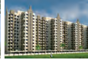
Dreams Lynnea, Kesnand road, Wagholi