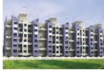
Dreams Solace, Hadapsar